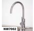
NW7002 Curved Goose Neck