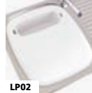
LP02 Board & Colander set