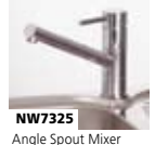
NW7325 Angle Spout Mixer