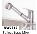
NW7312 Pullout Spray Mixer