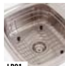
LP01 5/5 Drainer Basket