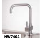
NW7404 Square Goose Neck

For more information call 1300 13 SINK (1300 13 7465) www.lakelandsinks.com.au